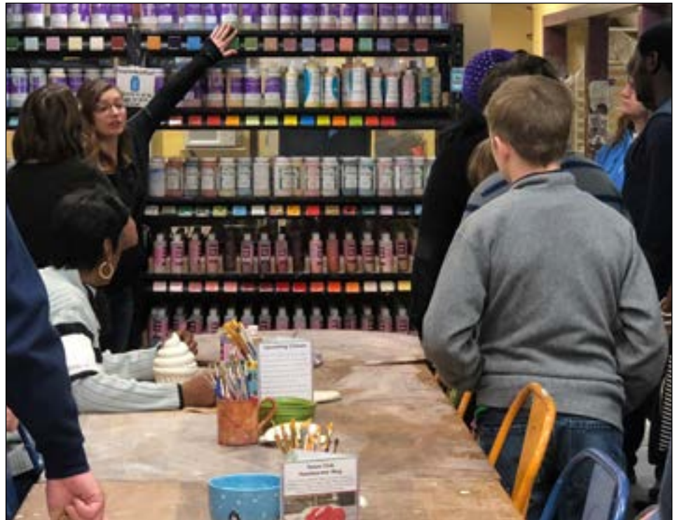
A recent Meet & Greet was held at an arts studio.

When we're having them at these places, we can use the facility as the new activity. We're still partnering with churches throughout the state, so when we're there, we try to have a craft or other activity that you can focus on. We're trying to stay away from the "minute-to-win-it" type games because we know it gets repetitive for you. When we have other activities, we're focusing more on having the parents move around rather than you.