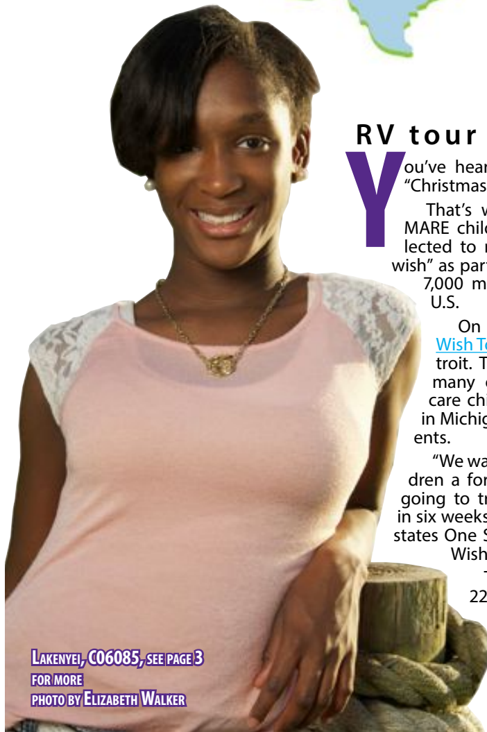
LAKENYE, C06085, SEE PAGE 3 FOR MORE

During the tour, One Simple Wish volunteers will be taking pictures and videos. See Tour , on page 3